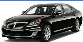
Hyundai Centennial (Limousine)